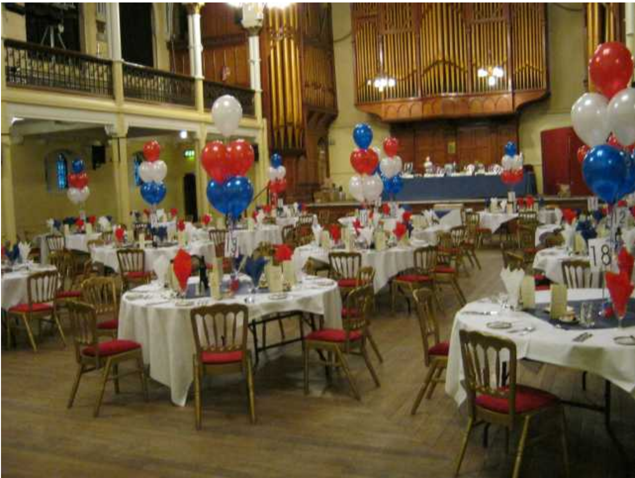
The Connaught Hall at 6.00pm on the 5 th November 2011