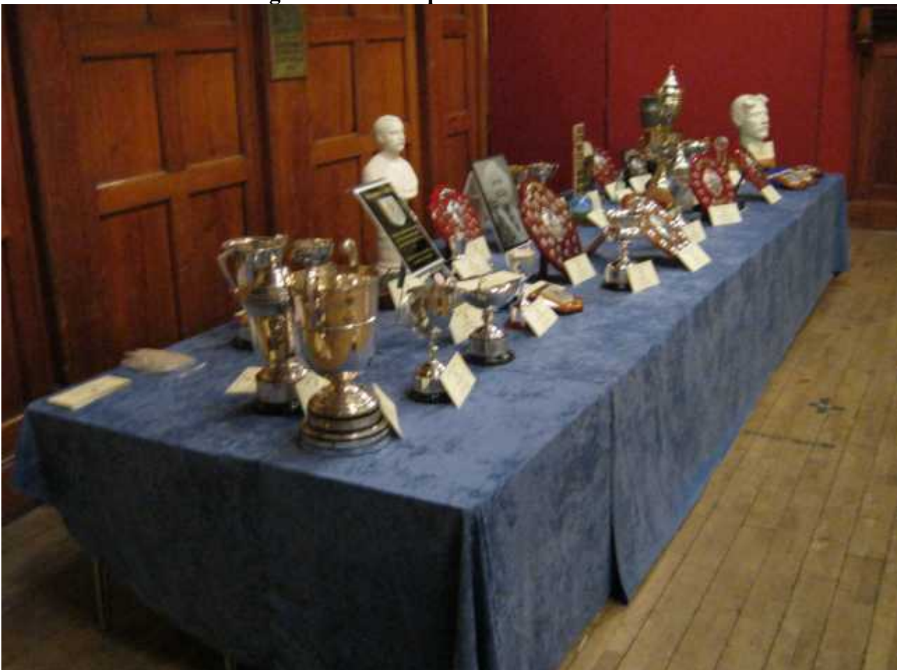
Channel Swimming Association Trophies ready for presentation